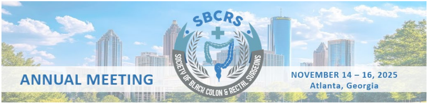
EXHIBIT OPPORTUNITY LEVELS